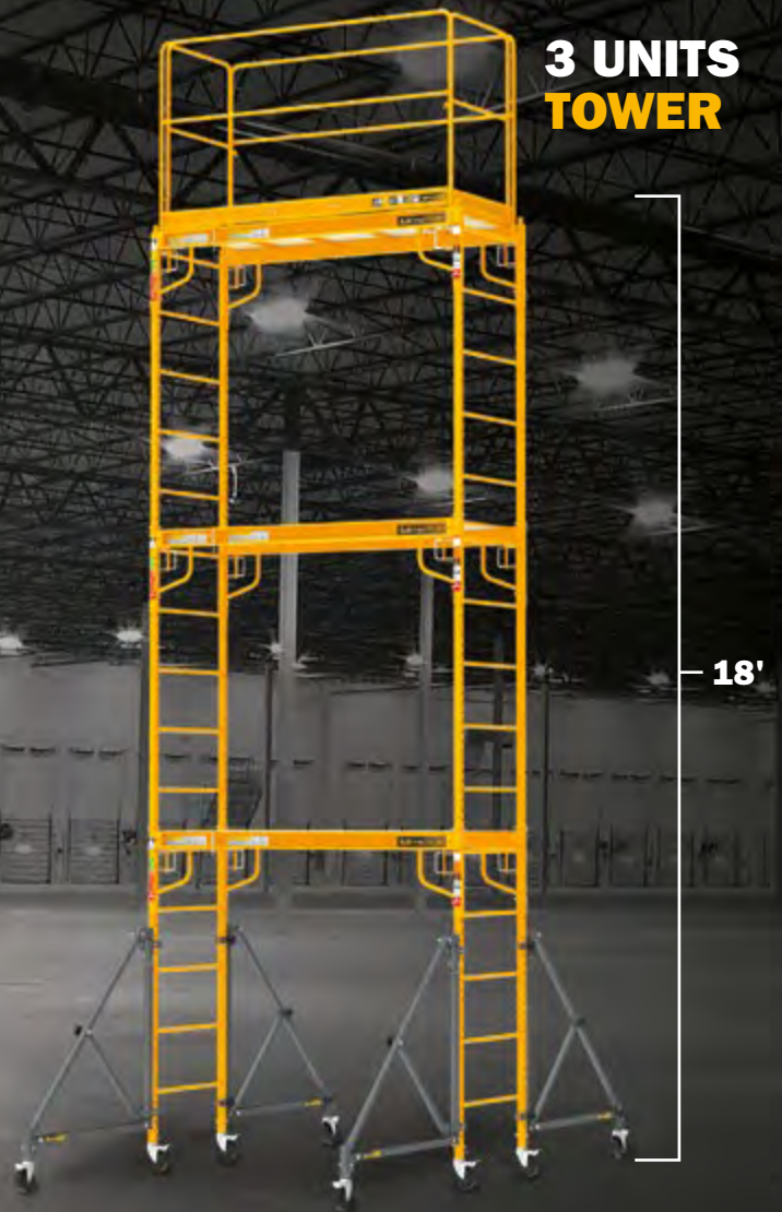
3 UNITS TOWER