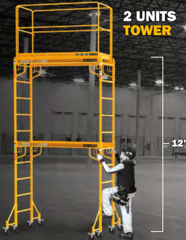
2 UNITS TOWER