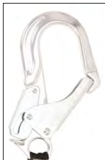
Form Hook (2-1/2" (64 mm) Gate Opening)