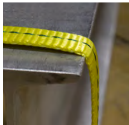
Sharp Edge Conditions