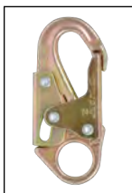
Snap Hook (3/4" (19 mm) Gate Opening)