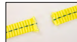
Failure due to sharp edge conditions