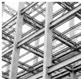
Sharp Steel Edges