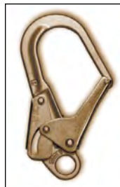
Steel Ladder Hook (2" (51 mm) Gate opening)