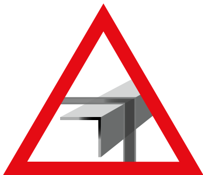
Global Sharp Edge symbol— Radius as sharp as 0.25 mm (0.0098")

If the installation will be overhead or at shoulder level, you should determine the minimum fall clearance requirement on the job site to help identify the correct class of SRD you should be using.