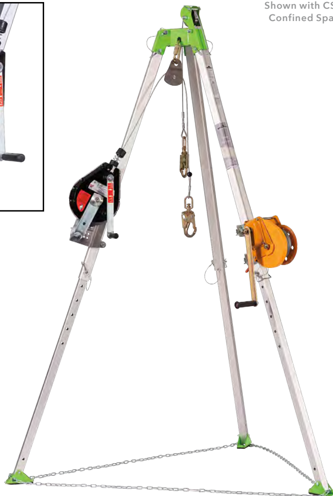
Shown with CSK3-60 Confined Space Kit