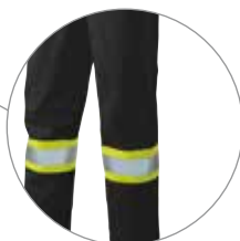
Hip to ankle leg zips/vents