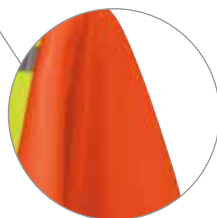
Mesh ventilated upper arms