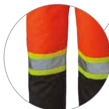
Double-layer reinforced knees