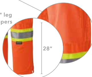
28" leg zippers