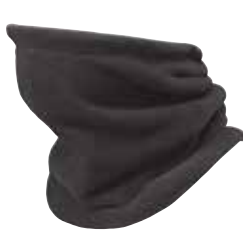
Neck Warmer / Face Mask