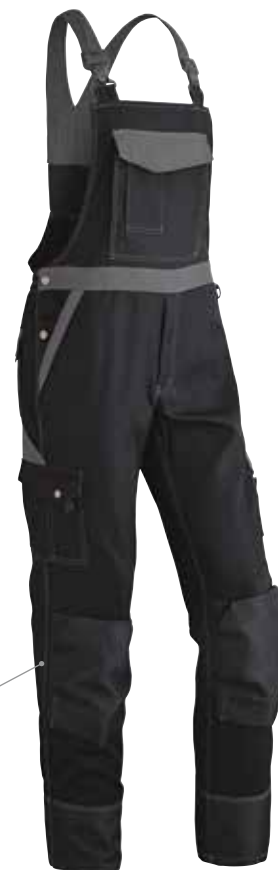
Cordura®-reinforced knees and ankles