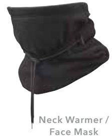
Neck Warmer / Face Mask