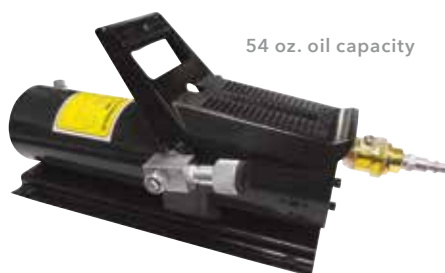
54 oz. oil capacity